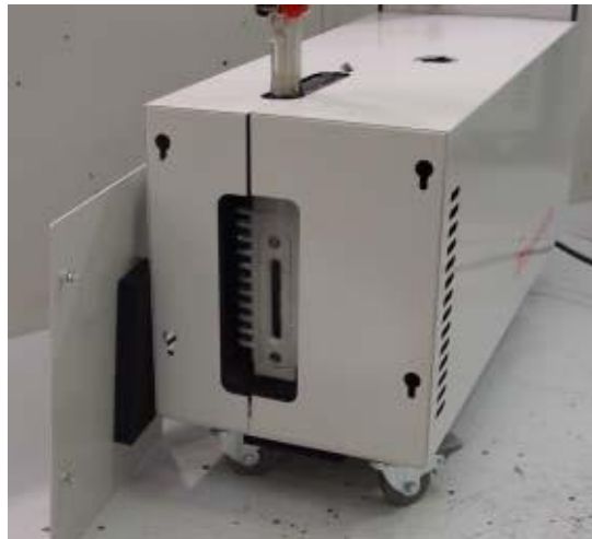
Figure 10 - Removing panel to gain access to filler cap