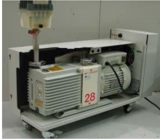
Figure 7 - Fitting second cover to right hand side of pump