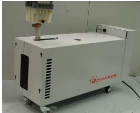
Figure 8 - Fitting end cover