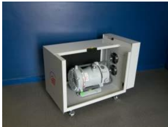
Figure 4 - Fitting second cover to right hand side of pump