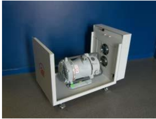
Figure 3 - Locating left hand panel on side of pump