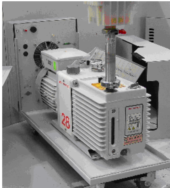
Figure 5 - Attaching inlet and exhaust fittings

The various elements of the Enclosure are designed to slot together without additional fixings.